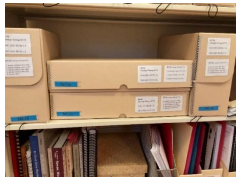
Boxed and neatly labelled.

When Oswego Grange's hall burned in October 1974, their members voted to consolidate with Winona adding 76 members, many of whom immediately became active contributors.